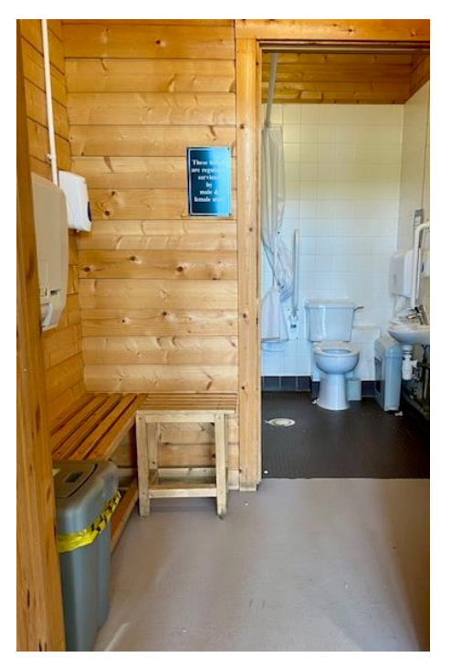
Inside accessible toilet