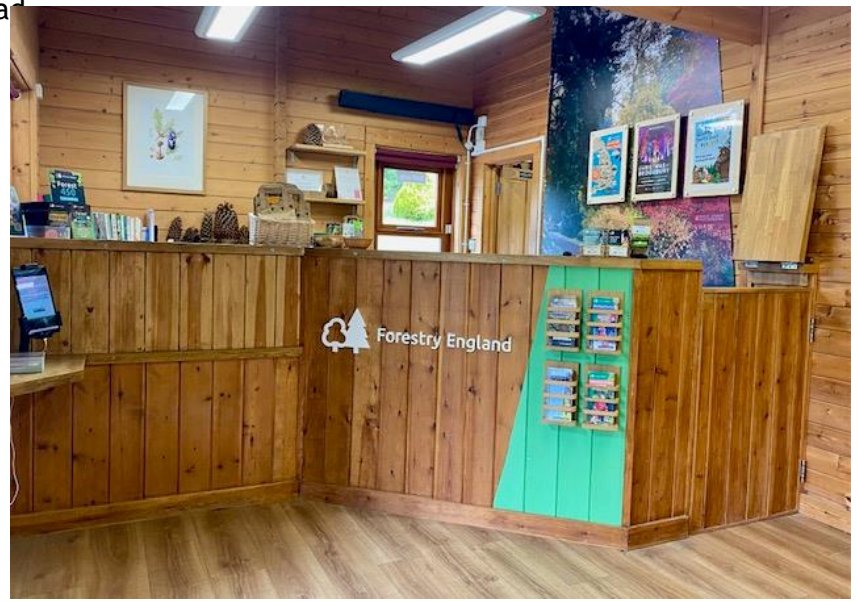
Inside the information point