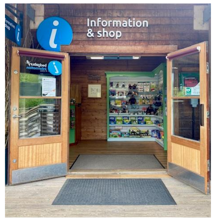
Manual doors to information point - doors are usually closed in colder weather.