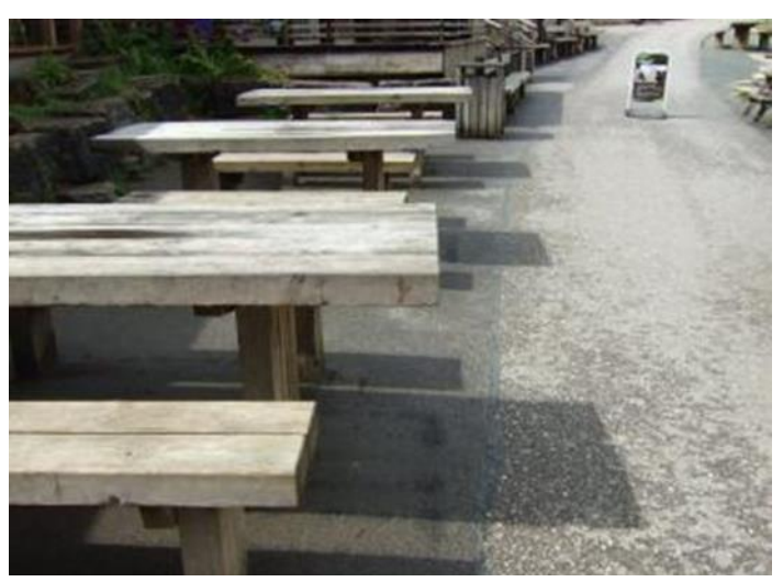
Picnic tables at the visitor centre