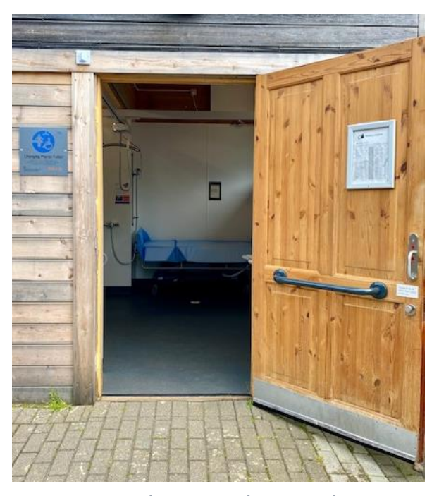
Entrance to changing places toilet