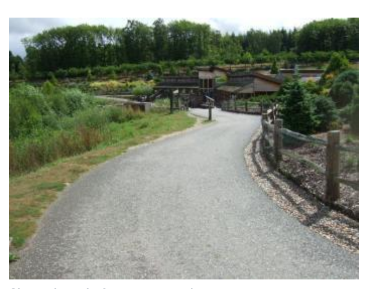
Sloped path from car park to visitor centre