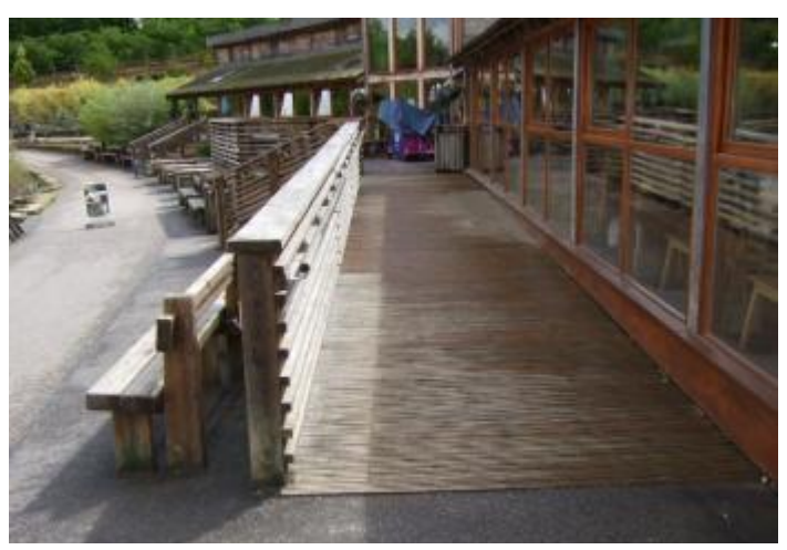
Ramp leading to atrium and cafe