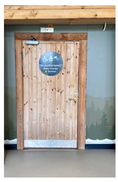
Entrance to accessible toilet