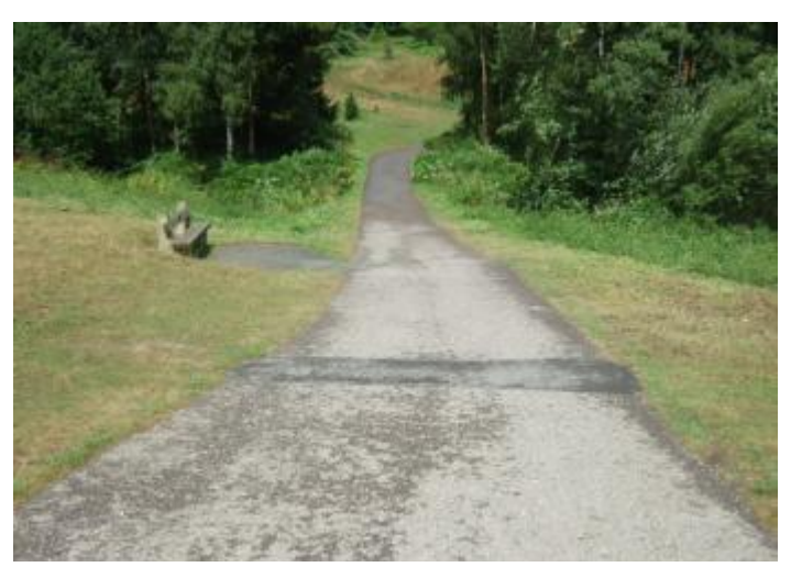
Tarmac path within the pinetum