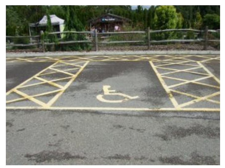
Accessible parking bay