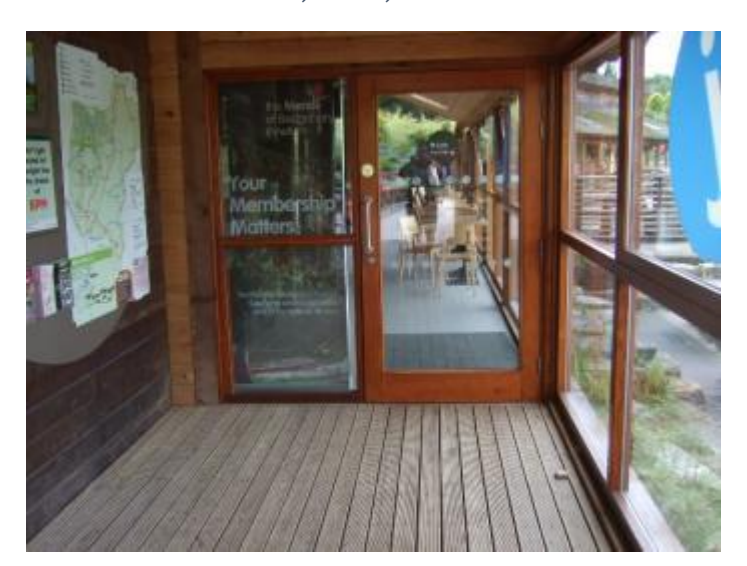
Manual door to atrium and café Bedgebury Access Guide | R Fletcher | 13/06/2024