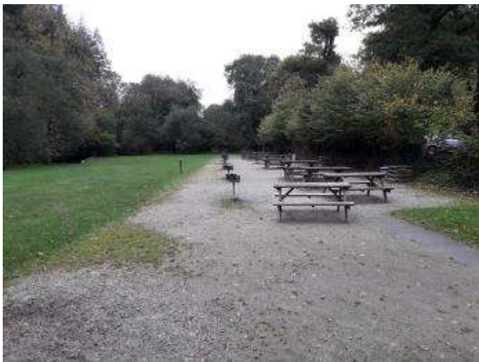
BBQ and picnic area