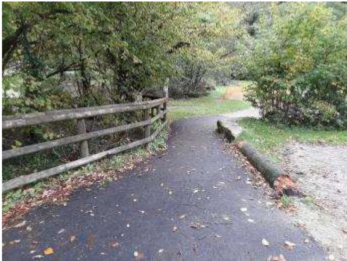
BBQ area entrance