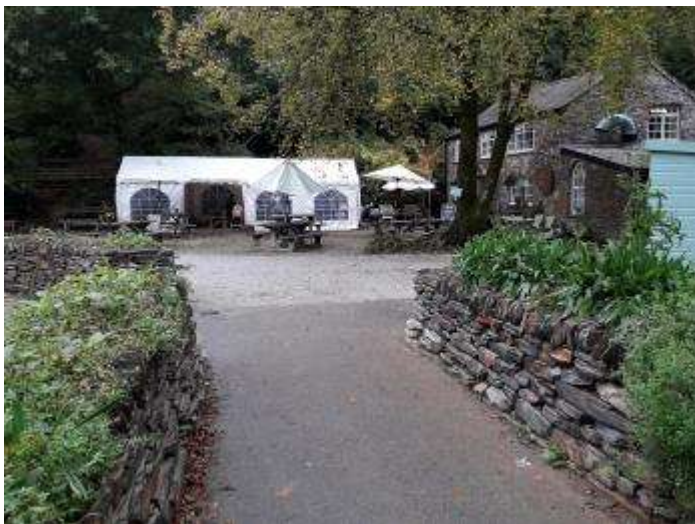
Front approach to Woods Cafe and outdoor seating area