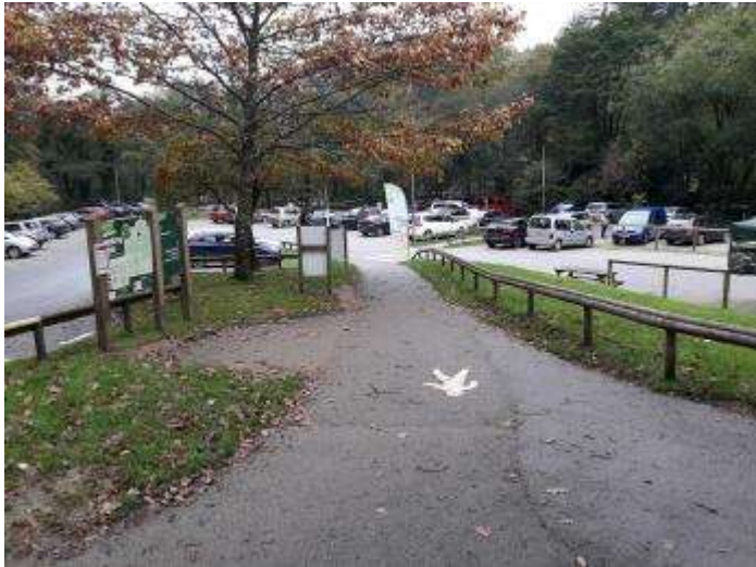
Information board at the start of the Lady Vale Trail