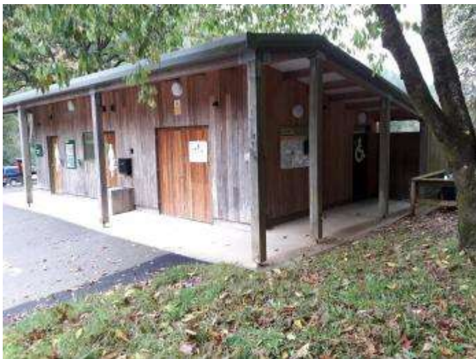
Toilet block with level access