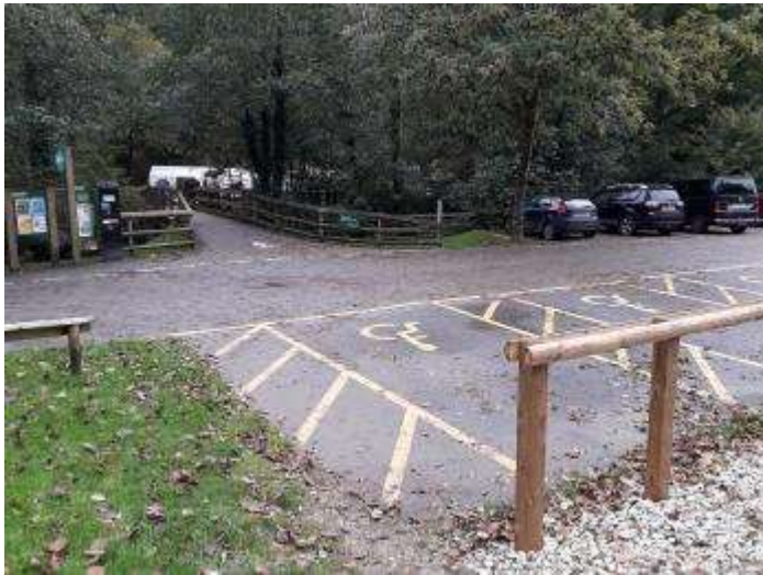
Accessible parking spaces opposite main route to Woods Cafe