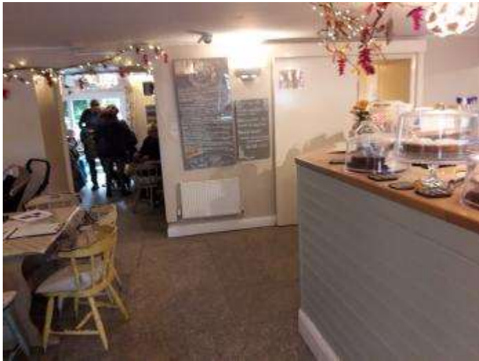
Interior of Woods Cafe