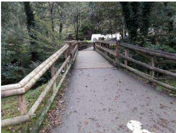
Route from car park to Woods Cafe