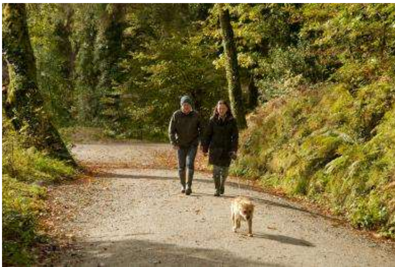
Lady Vale Trail