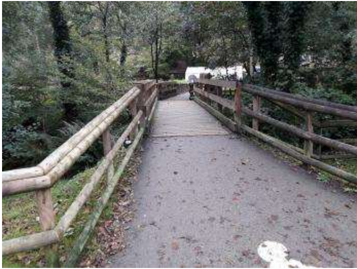
Approach from car park to central area and Woods Cafe