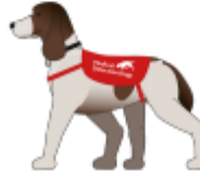
Medical Detection Dogs