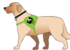
Seeing Dog Alliance