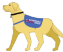
Veterans With Dogs