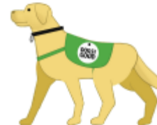
Dogs For Good