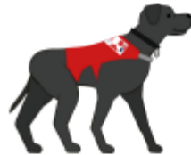
Service Dogs UK