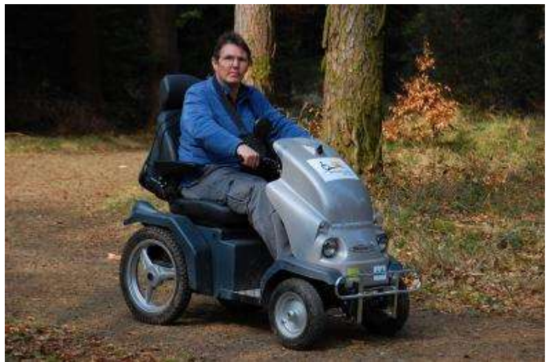
Three off-road mobility scooters are available to hire at Haldon.