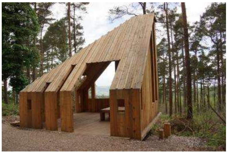
Sheltered viewpoint with level access and seating