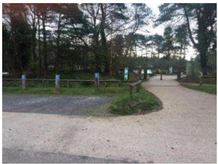
Accessible car parking spaces and entrance to main visitor area.