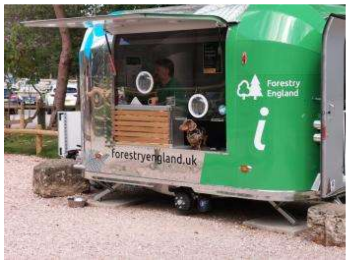
Front of the Info Pod with low section of counter.