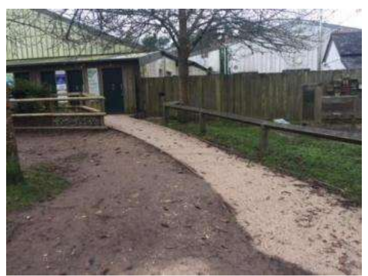
Path leading to the toilets including the accessible toilet.