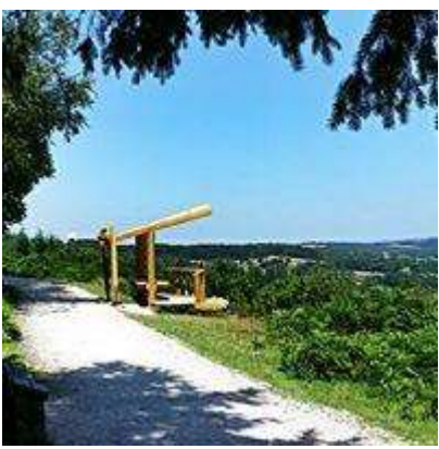
Section of the Discovery Trail.

• This trail is fully surfaced, suitable for wheelchairs and has regular resting points. With stunning views and children's dens, this trail is fun for everyone. Please note this is a multi-use trail.