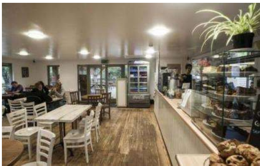
Inside view of The Ridge Cafe