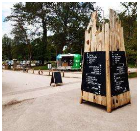
Info Pod approach and wayfinding in the central visitor hub

The Ridge Cafe rear entrance and decking area