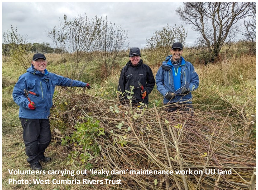
Volunteers carrying out 'leaky dam' maintenance work on UU land

Recent tasks carried out by West Cumbria Rivers Trust and volunteers on United Utilities land (west) have included leaky dam maintenance to help reduce sediment and nutrient input into the River Ehen, woodland management which will improve the diversity of existing woodland areas, invasive non-native species control and surveying. Survey work includes fish, wildflower, trees and Marsh fritillary web-counting, which then feed into monitoring programmes. Looking forward, plenty of tree planting is scheduled this winter season, enhancing biodiversity and increasing water storage. Further tree management is planned, as are habitat improvement works and projects to reduce sediment and nutrient run off including willow stakes, laying live woody debris, sediment traps & fencing.