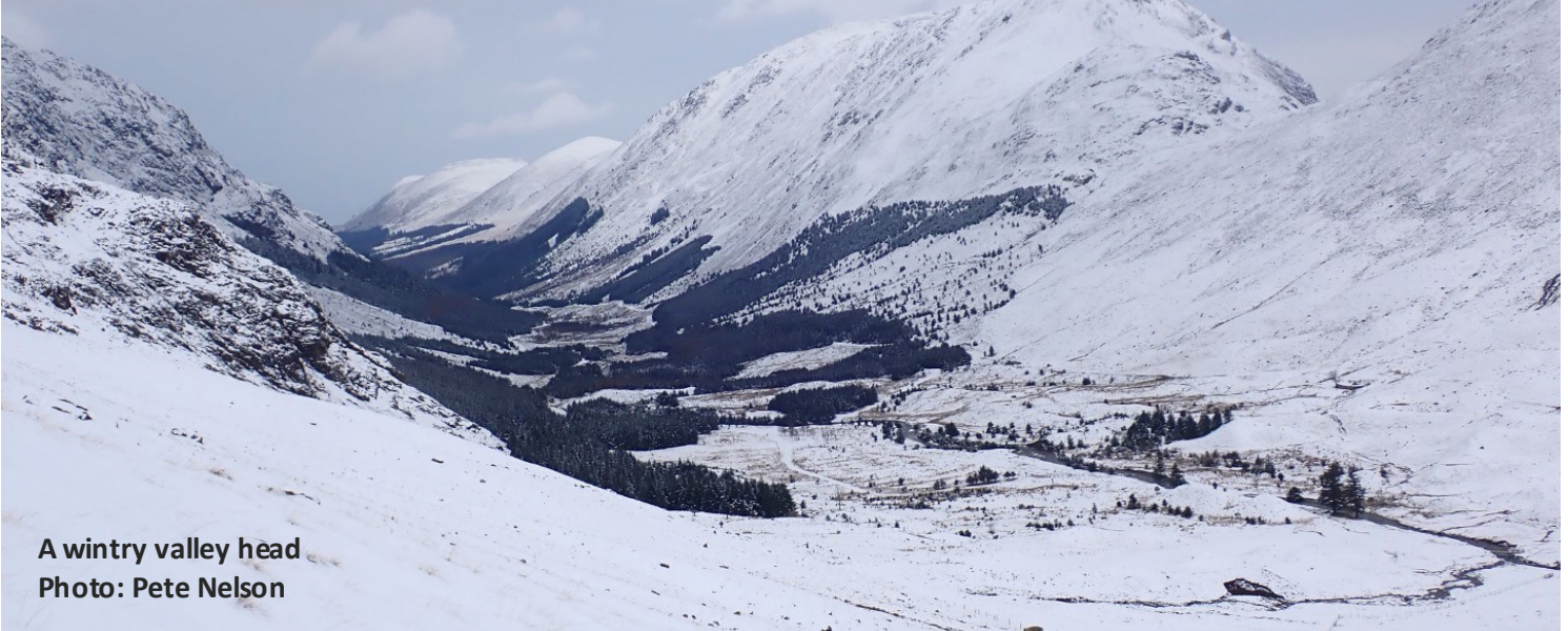
A wintry valley head