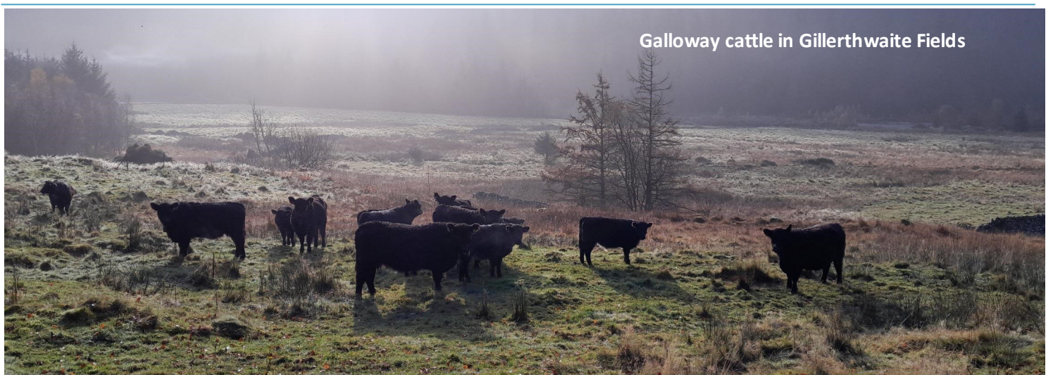
Galloway cattle in Gillerthwaite Fields

Wild Ennerdale is a partnership of people and organisations led by the Forestry England, National Trust, United Utilities and Natural England. The Wild Ennerdale Partners are allowing the landscape to evolve naturally with reducing human intervention and invite you to explore this unique valley and experience its special sense of wildness. wildennerdale.co.uk