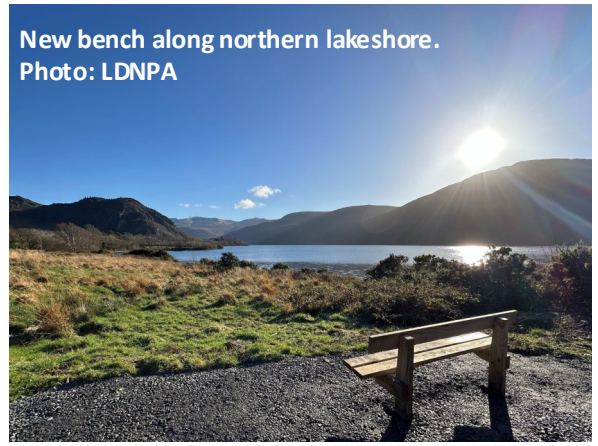
New bench along northern lakeshore.

The delivery team at LDNPA have provided regular updates via community newsletters, on-site signage and a drop-in session at The Gather.